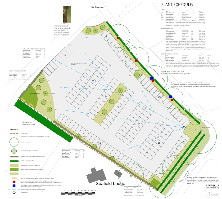
Proposed Overspill Car Park - 151 Spaces