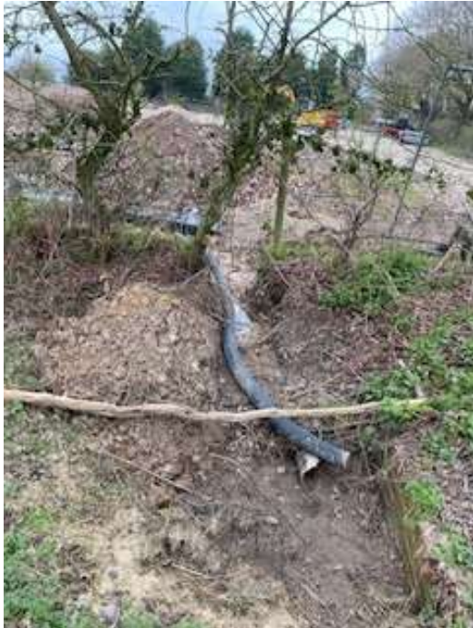
2022 – View of overspill car park from Cherry Pit Lane